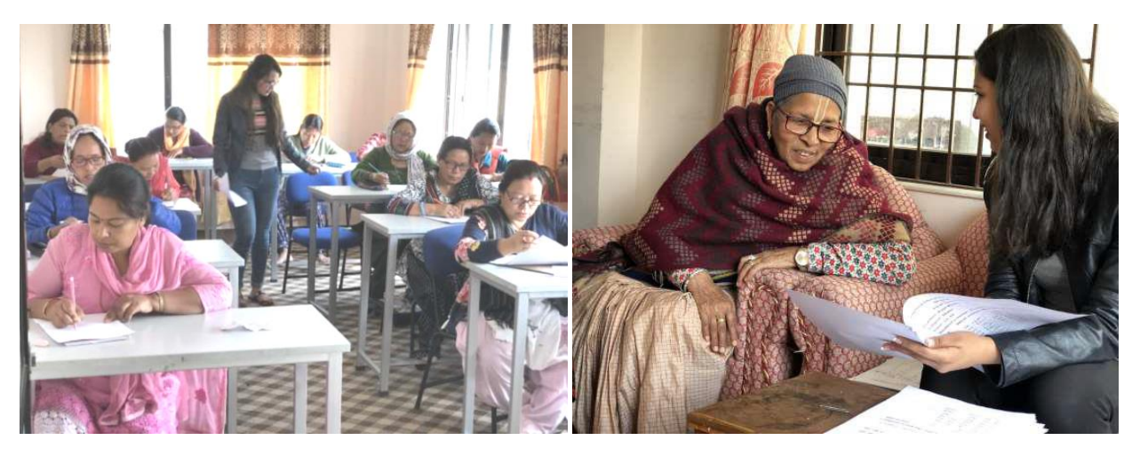
Final examinations begin

The process of hiring new teachers at the CECC, both thoughtful and time-consuming, has resulted in a strong team. The process includes having the candidates plan and conduct classes (while being observed), gathering feedback from students and other teachers, assessing content knowledge as well as techniques and rapport with students, and discussing clear expectations for the position. While it has been heart-warming to have some of our "former kids" on the teaching staff, it should also be noted that the presence of "outsiders" has helped to elevate the professionalism among the staff as a whole.