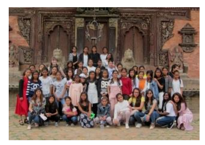
Field trip to the ancient city of Bhaktapur

Motivated by the successful Winter Camp, the Chelsea Center staff and Papa's House children organized a Summer Camp during the April break in the school year. From April 1-16, the camp consisted of five different group activities: drama and dance, journalism, science, public speaking, and photography and vlogging. From April 4-11, a second summer camp took place at the Chelsea Center with a group of Australian high school students and their teachers that was coordinated with our Volunteer Nepal. Fun activities for these volunteers and Papa's House children included dance and drama, arts, sports, magic, and writing workshops.