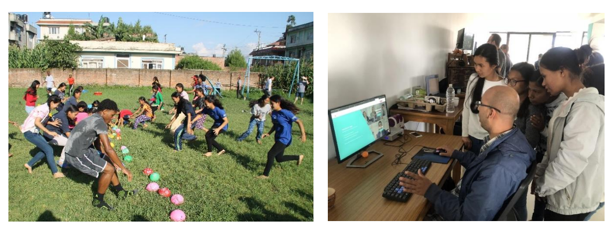
July 4<sup>th</sup> games with volunteers from NYC