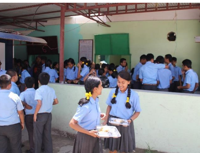
New school uniforms for Goldhunga made by NOH tailoring girls