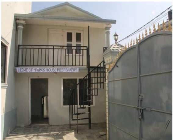
Papa's House Bakery on Chelsea Center campus