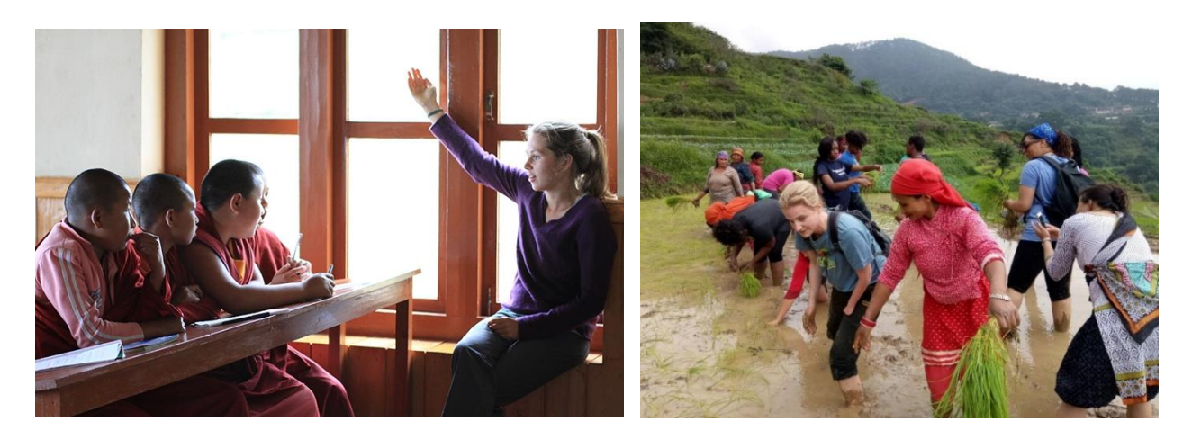
Volunteer in a classroom at Bigu

Volunteer Nepal provided over two dozen placements throughout Nepal--from Kathmandu to remote villages. Options include volunteering in hospitals and medical clinics, schools, rehabilitation centers, ashrams, human rights NGOs, animal shelters, and village agriculture. In 2018, most of the volunteer placements involved teaching. Another popular placement was with orphanages. The third most popular option was community health and medical assistance.