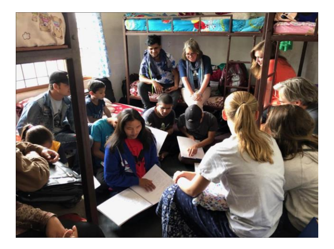
Reading donated braille books at Goldhunga with NOH volunteers