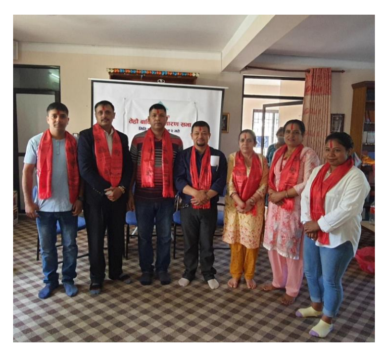
Papa's House NGO Board of Directors meeting at the Chelsea Center

According to the by-laws of Papa's House NGO, every three years, the board of directors has to be re-elected and, if needed, new members must be added to the required seven-member board. The last Papa's House board was formed in July 2018, so in 2021 a new board was formed.