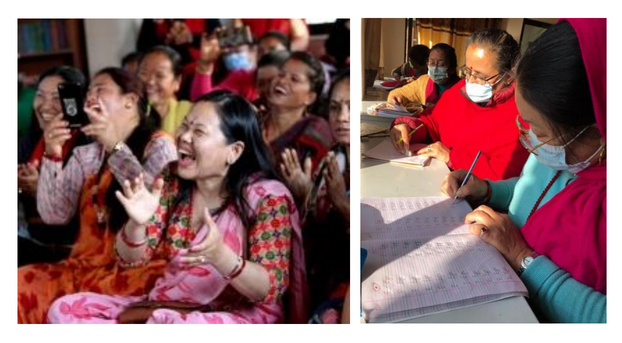
International Women's Day at the Chelsea Center

When it was safe, the Chelsea Center still organized celebrations for the community women, as on March 8 for International Women's Day, when games like musical chairs, bursting balloons and quizzes were organized, along with several performances from teachers and students, in a program filled with fun, laughter and joy.