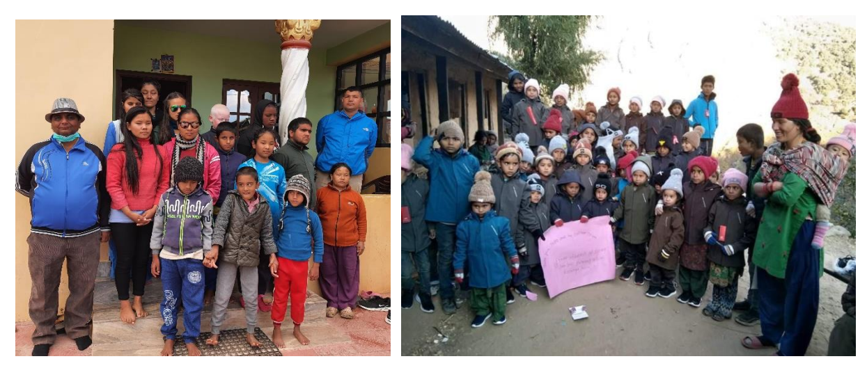
Goldhunga Blind Children's Home